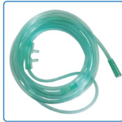
Nasal Cannula 1pc