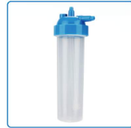
Humidifier bottle 1pc